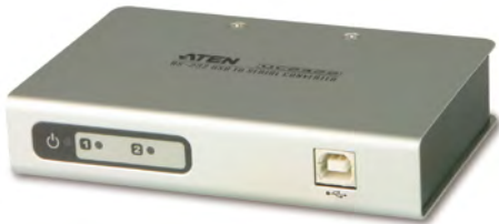
UC2322 / UC4852