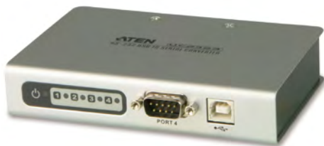
UC2324 / UC4854