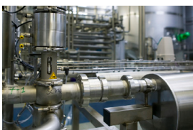
Food Industry, Dairies & Breweries

A world leader in temperature gauges, Rototherm has become the standard for accurate and reliable measurement across the following industries: