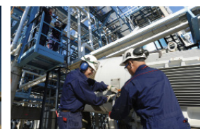
Heating & cooling Systems & Pipework