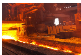
Ovens, Dryers & Tanks