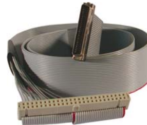
TA105: ribbon cable with 50 pin ribbon cable connector and 50 pin SCSI-2 male connector

A 2 pin terminal block on the transition module can be used to provide +5V to the RJ45 connectors (pin 1) of channel 3 to 8 and to supply the on board termination for RS422/ RS485. Support of the +5V is selectable by jumper. The +5V is fuse protected by a 1A multi-fuse.